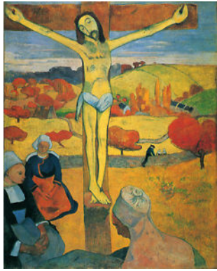
Gauguin, Yellow Christ , Post-Impressionism, France