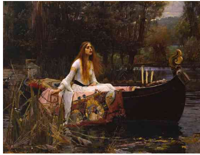
Waterhouse, The Lady of Shalott , Pre-Raphaelite, Britain