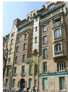
Hector Guimard, Castel Beranger , Art Nouveau, France