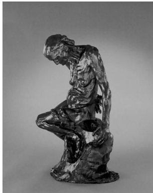
Rodin, The Helmet Maker's Wife , Avant-garde, France