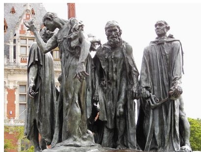
Rodin, The Burghers of Calais , Avant-garde, France