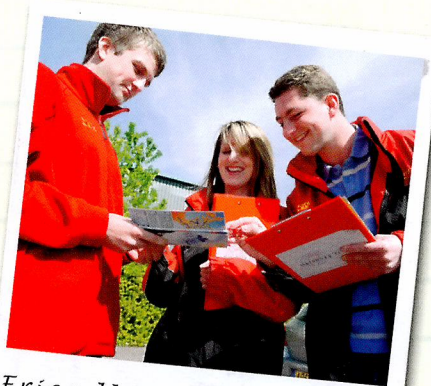
Friendly Group Leaders