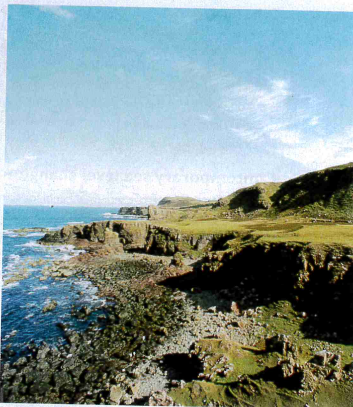
▲ Figure 6 A raised beach on the Isle of Arran

Fjords are formed when deep glacial troughs (see 4.8) are flooded by a rise in sea level. They are long and steep-sided, with a U-shaped cross-section and hanging valleys. Unlike rias, fjords are much deeper inland than they are at the coast. The shallower entrance marks where the glacier left the valley. Fjords can be found in Norway, Chile and New Zealand (Figure 8).