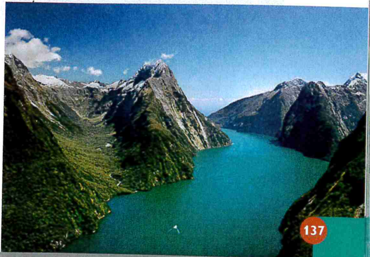
▼ Figure 8 Milford Sound (a fjord) on New Zealand's South Island