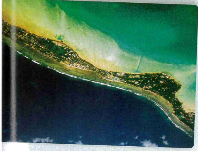
Figure 10 Tarawa Atoll, Kiribati – a vulnerable speck in the ocean