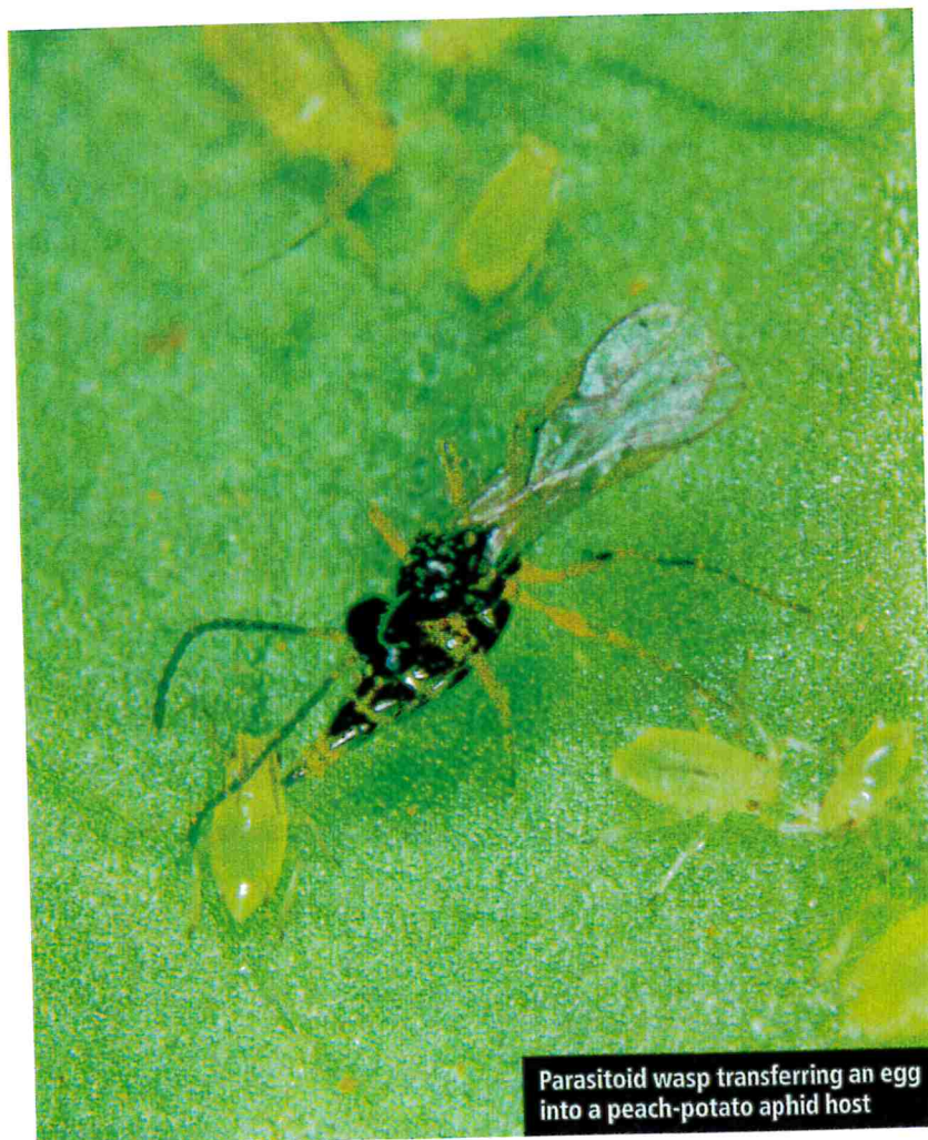
Parasitoid wasp transferring an egg into a peach-potato aphid host

focused on ways to reduce aphid numbers and successfully control their population.