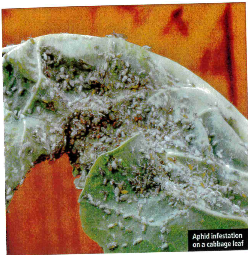
Aphid infestation on a cabbage leaf