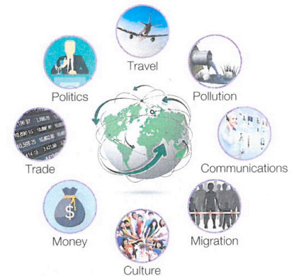
▶ Figure 1 Globalisation describes the often complex processes associated with an increasingly interconnected world

Globalisation is a term used frequently within trade and economics and describes a process of opening up world trade and markets to transnational companies (TNCs) and an increasingly interconnected world (Figure 1). However, a definition of globalisation should also involve the associated effects of this process on people, culture, political systems, environment and the quality of life of every human on the planet!