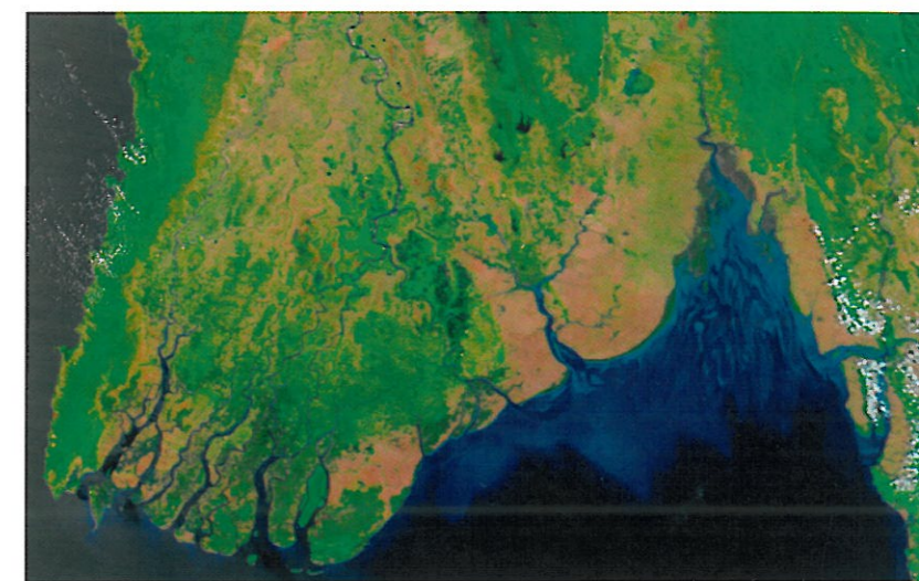
April 15th, 2008

After the Storm: Voices from the Delta was the title of a report published in March 2009 by the Emergency Assistance Team and the Centre for Public Health and Human Rights at Johns Hopkins Bloomberg School of Public Health, USA. The report stated that 'the junta's wilful