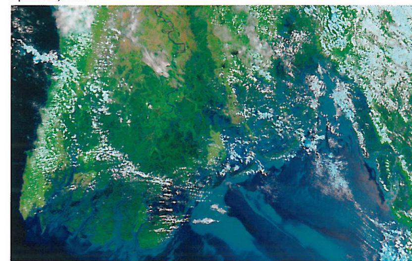
May 5th, 2008

disregard for the welfare of the 3.4 million survivors of Cyclone Nargis which struck the Irrawaddy Delta... killing 140,000 people [and a host of other abuses detailed by the research] may amount to crimes against humanity under international law'. Aid workers from the Emergency Assistance Team (EAT-Burma) and experts from the university spent months interviewing survivors and relief workers about the cyclone's aftermath. Their report urged the UN Security Council to refer the Burmese regime to the international criminal court.