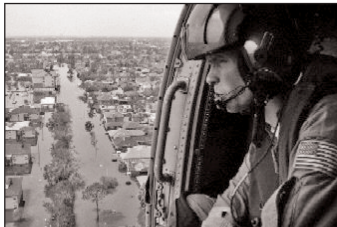
Figure 6: Emergency services look for survivors trapped on rooftops

and 7). Months later, thousands of people remained homeless and unemployed. Most were still staying in cities hundreds of miles away. Many believed that the government and emergency services had mismanaged this terrible disaster.