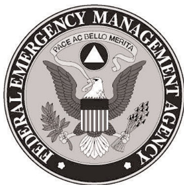
Figure 2: The FEMA logo

Many tropical storms and hurricanes never reach land and so have little effect on humans. Organisations such as the NHC in Florida use satellites to spot the early storms off the coast of Africa and then monitor their progress as they move westwards. They continuously make predictions about the path and possible landfall sites. This information is then fed to the media and to the emergency services, who have to make life or death decisions about whether to evacuate areas or not. In the USA, a special organisation called FEMA (Federal Emergency Management Agency) co-ordinates all the emergency work (Figure 2).