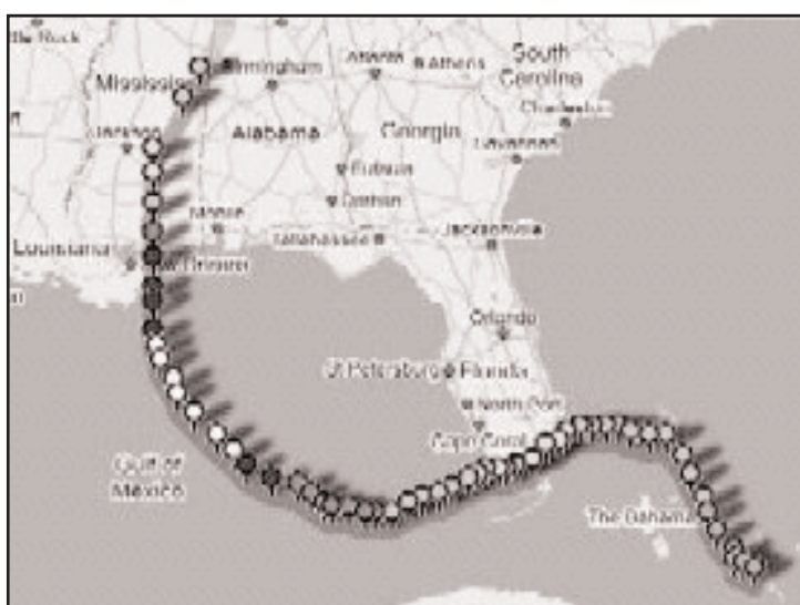
Figure 3: The track of Hurricane Katrina