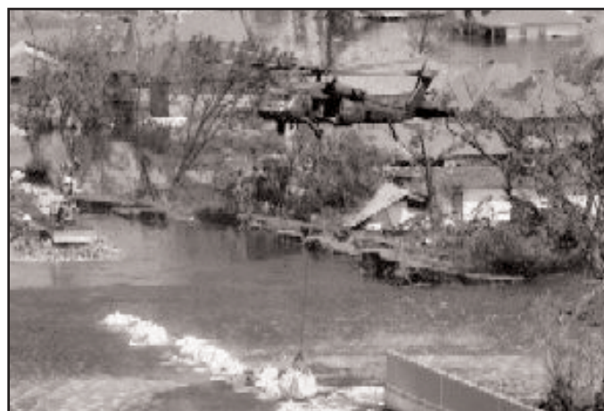
Figure 7: Helicopters desperately try to block a broken levee wall