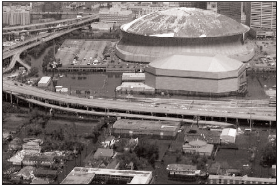
Figure 5: The Superdome was damaged and the surrounding area flooded

It took a very long time for the water trapped in the city streets to be pumped out. Bodies of victims were left lying in the streets and the search for missing people was very poorly organised (Figure 6