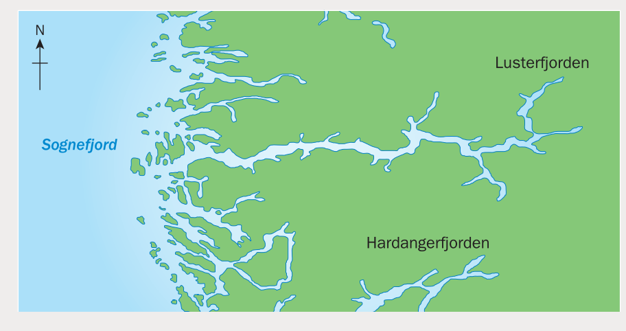
Figure 3 Sognefjord, Norway

• They are relatively straight landforms like many glaciated valleys.