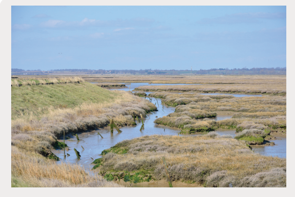
Figure 6 Essex coast

approaching waves and encourages deposition. These are coastlines where depositional features, such as areas of salt marsh, and landforms like dunes, spits and bars, are common.