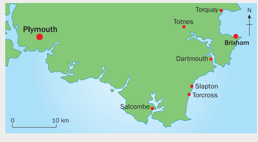
Figure 4 Rias on south Devon coast

An atlas map of the south coast of Devon and Cornwall will show such inlets clearly.