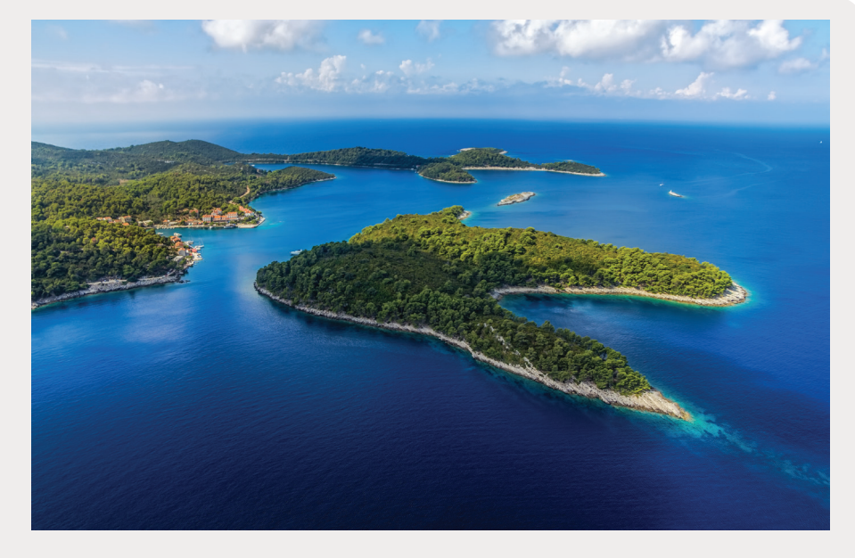
Figure 5 Dalmatian Coast, Croatia: aerial view of island of Mljet, Dubrovnik archipelago

There are rather similar features to fiords in south Devon, shown in Figure 4. The coastline has a number of elongated and branching drowned valleys called rias. They are a different shape and depth from fiords, but were formed in a similar way. Rias are drowned river valleys. They formed at the end of the Ice Age when sea level rose.