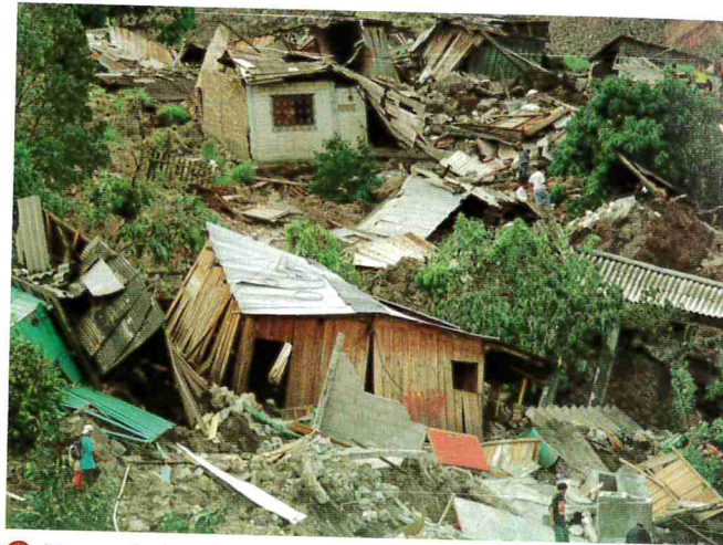
Figure 8 Landslide caused by Hurricane Mitch, 1998

There is some evidence that load release caused by tropical storm-induced landslides may trigger earthquakes in tectonically stressed regions. For example, the 2010 Taiwan earthquake occurred just two years after Typhoon Morakot had dumped 300 mm of rain in just five days. Research carried out at the University of Miami found that 85 per cent of earthquakes of magnitude 6 and above occurred within the first four years after a very wet storm.