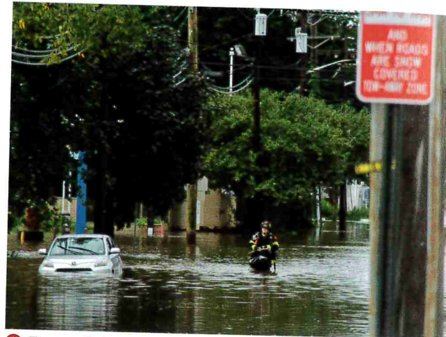
Figure 7 New Jersey after flooding by the Passaic River as a result of Hurricane Irene, 2011

As a tropical storm moves inland, it gradually weakens as its moisture (and energy) supply is cut off. However, it may still result in significant river flooding due to the intensity and sheer quantity of rain falling on the river basin. In August 2011, intense rainfall associated with Hurricane Irene caused widespread river flooding throughout New Jersey, USA, resulting in the evacuation of over one million people (Figure 7). The damage was estimated at over US$1 billion.