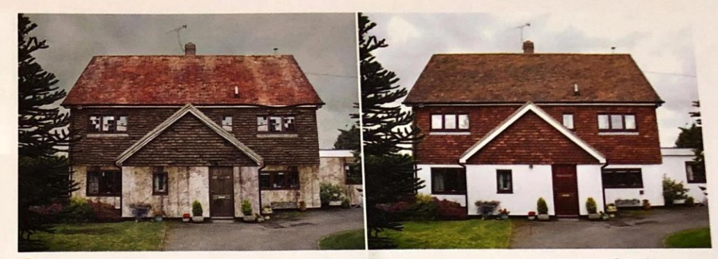
S Figure 4 A photograph can be digitally altered to change our perception of a place

Unfortunately, you cannot avoid being human or living in a world of representations drawn by mere mortals. All researchers face the same problems of viewing places through the eyes of other people and, furthermore, being themselves subjective. How can we stay alert to these limitations?