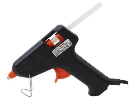
Mini hot melt glue gun