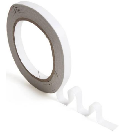
Double sided tape