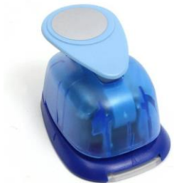
Circle hole punch 1 inch