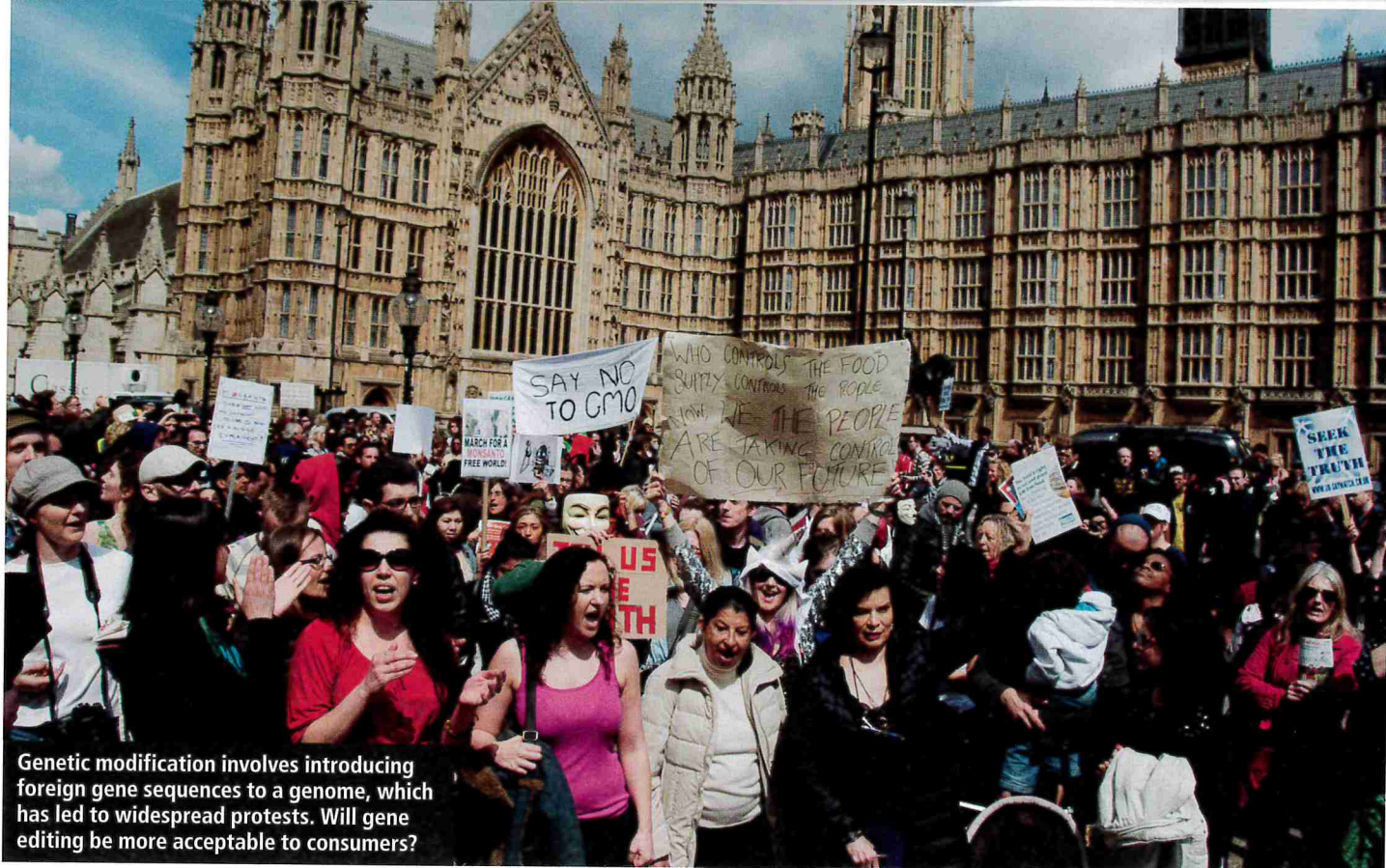
Genetic modification involves introducing foreign gene sequences to a genome, which has led to widespread protests. Will gene editing be more acceptable to consumers?