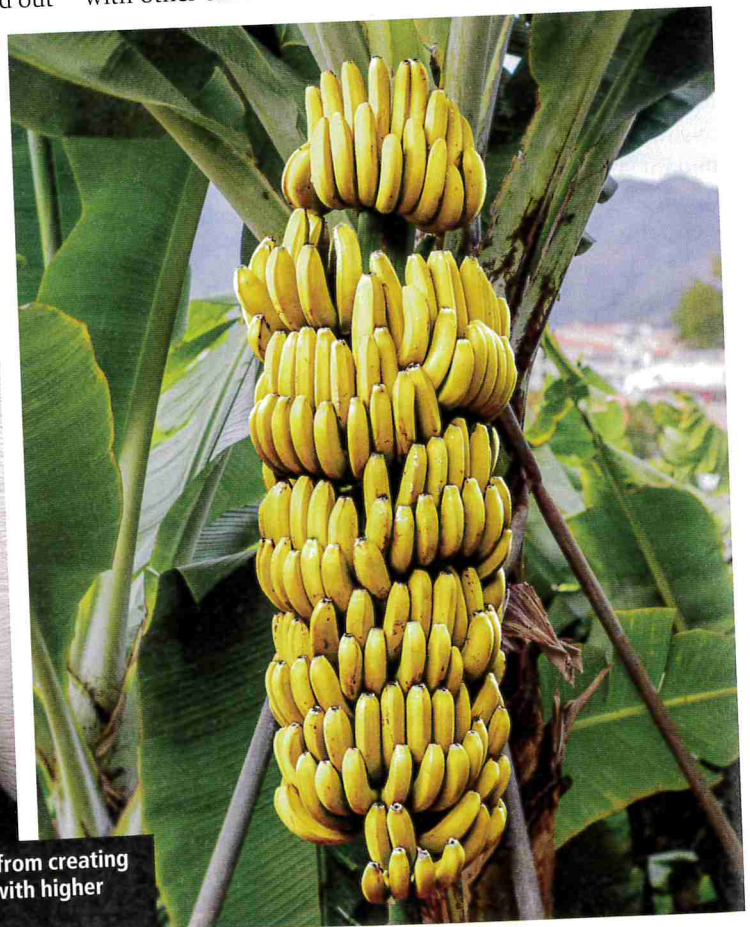
Gene editing techniques offer exciting opportunities in agriculture, from creating resistance to diseases in pigs and other animals to designing crops with higher yields and better resistance to drought and disease