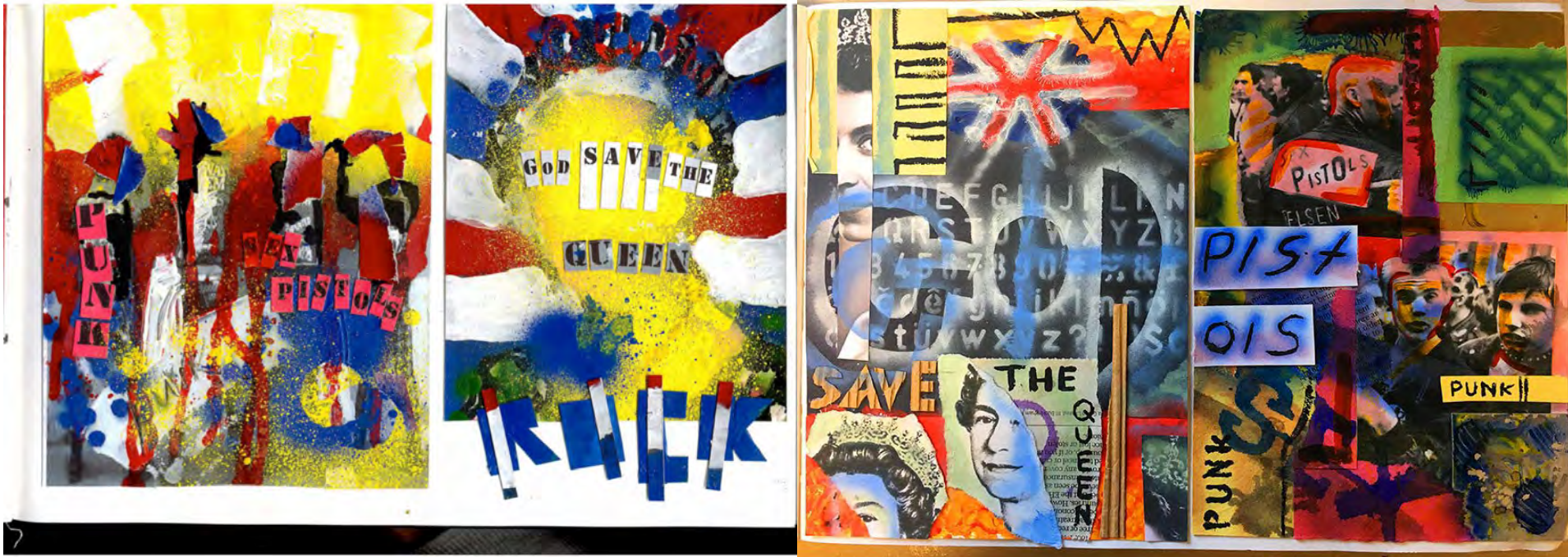
More examples of mixed media designs based on Jamie Reid and the Punk Art Movement