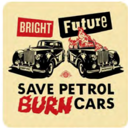
Magazine - Shepard Fairey x Jamie Reid Print Collaboration