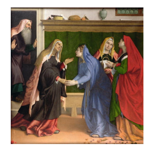
Lorenzo Lotto, The Visitation, 1534-35