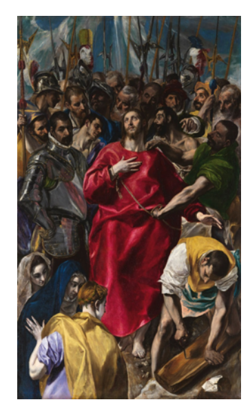
El Greco, The Disrobing of Christ, 1577-79