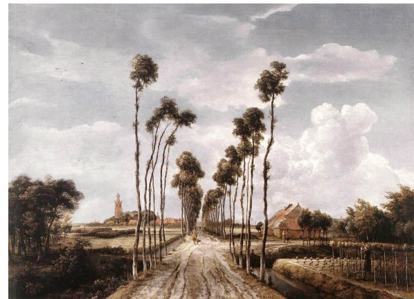
Meindert Hobbema, The Avenue at Middelharnis , 1664