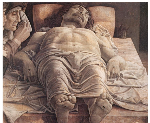
Andrea Mantegna, Lamentation of the Dead Christ , 1490