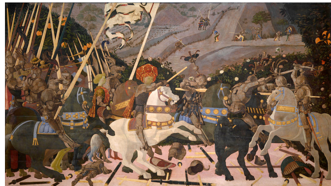
Paolo Uccello, The Battle of San Romano , 1438-40