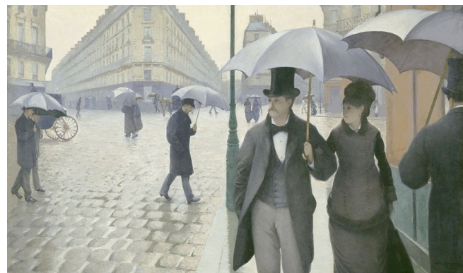
Gustave Caillebotte, Paris Street, Rainy Day , 1877