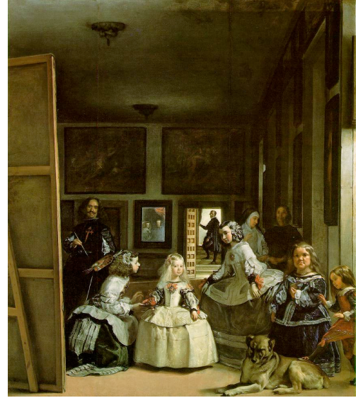
Velazquez, Las Meninas (The Maids of Honour) , 1656