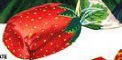
CHOCOLATE STRAWBERRY CUP Strawberry jam and cream encased in milk chocolate.