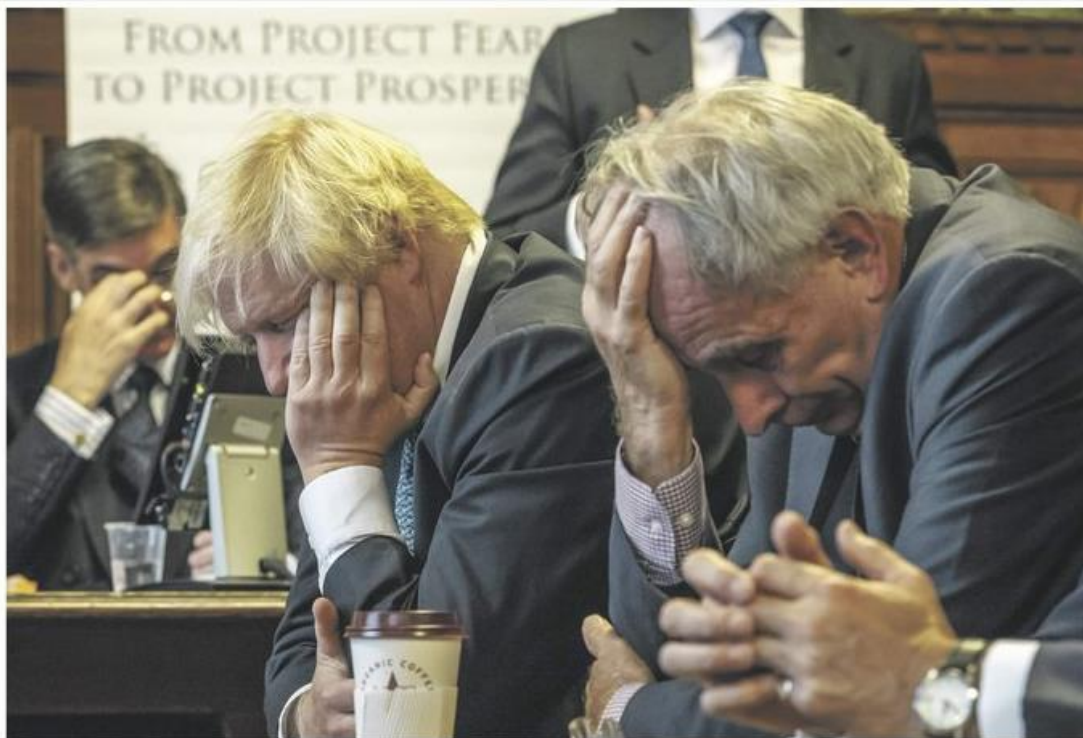
Tory MPs Jacob Rees-Mogg, Boris Johnson and Peter Bone reflect at a House of Commons gathering of Brexit supporters