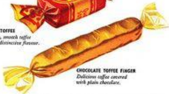
CHOCOLATE TOFFEE FINGER Delicious toffee covered with plain chocolate.