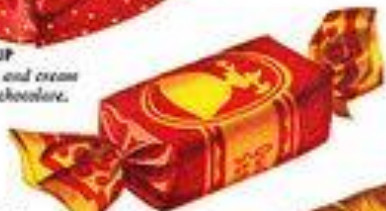
HARROGATE TOFFEE The delicious, smooth toffee with a most distinctive flavour.