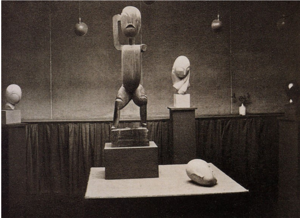
Fig. 2: Constantin Brancusi, The First Step, 1913, wood