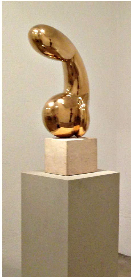
Fig. 3: Constantin Brancusi, Princess X, 1915-1916, bronze