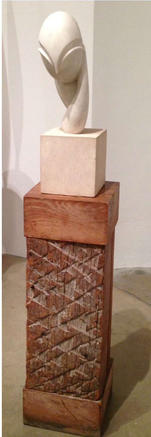
Fig. 4: Constantin Brancusi, Mademoiselle Pogany (III) , 1931, marble, limestone, and oak base; image from the Philadelphia Museum of Art, courtesy of the article's author.