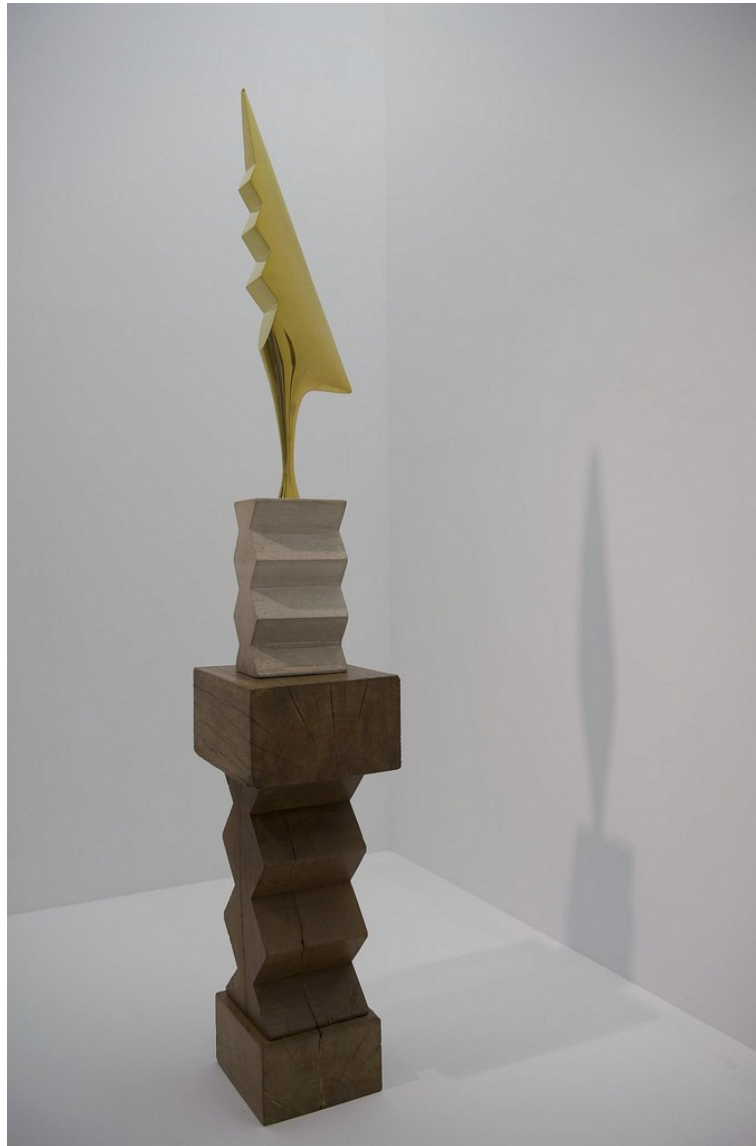
Abb. 7: Constantin Brancusi, The Cock, 1935, bronze