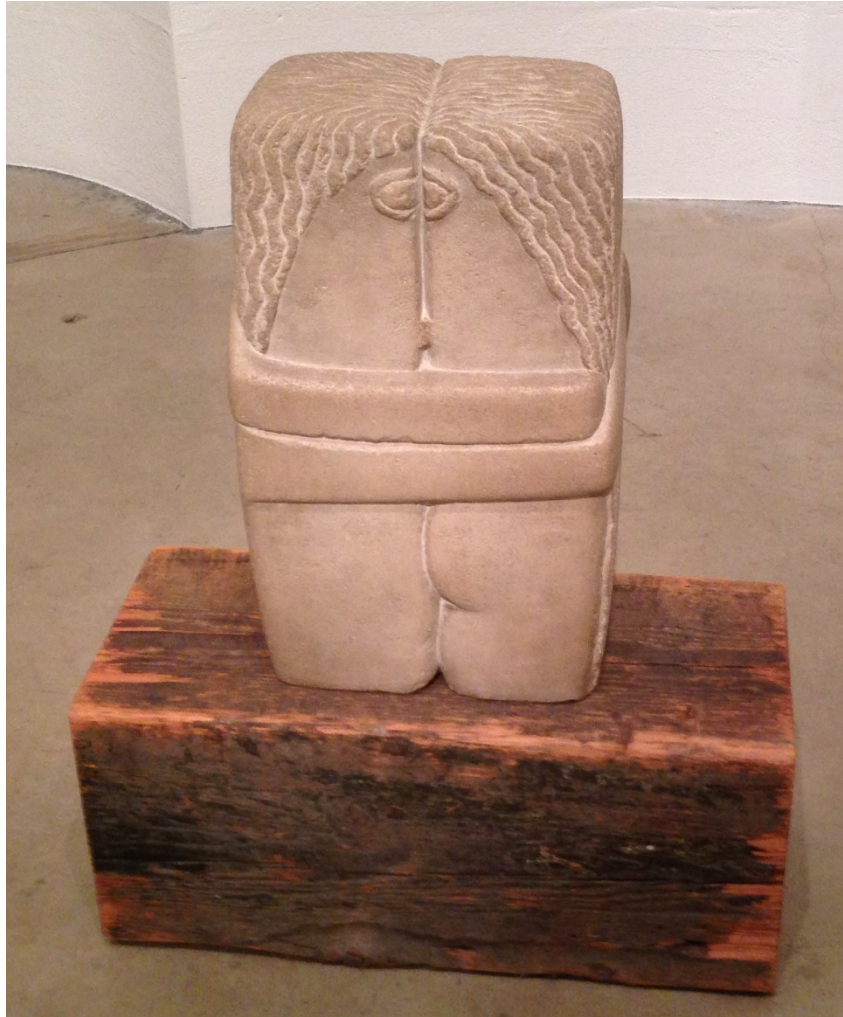
Fig. 1: Constantin Brancusi, The Kiss , 1916, stone; image from the Philadelphia Museum of Art, courtesy of the article's author.

wood sculptures and to be critical of his choice, for it caused subsequent art historians to limit their primitive studies to Brancusi's wood sculptures while disregarding his sculptures in other materials.