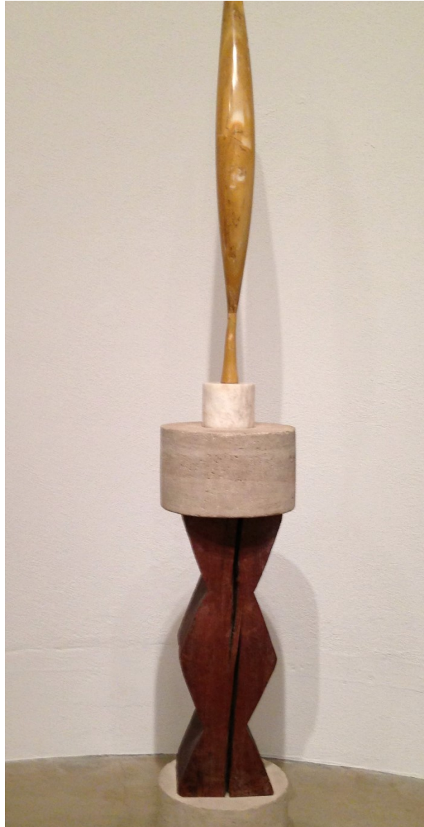
Fig. 5: Constantin Brancusi, Bird in Space , 1923–1924, marble, limestone, and oak base; image from the Philadelphia Museum of Art, courtesy of the article's author.

Bach goes on to say that “Brancusi’s work points the way to a necessary widening of the definition of modernity”. 38 Bach should have used the term modernism instead of “modernity” because it is a more