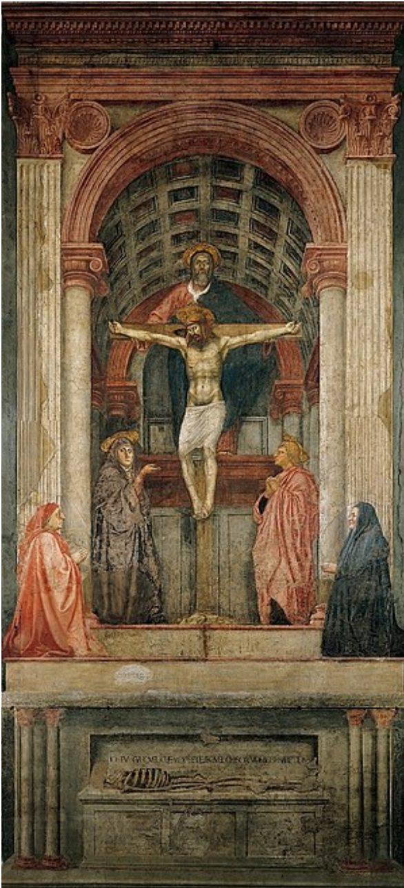
Masaccio, The Holy Trinity , c1427, fresco