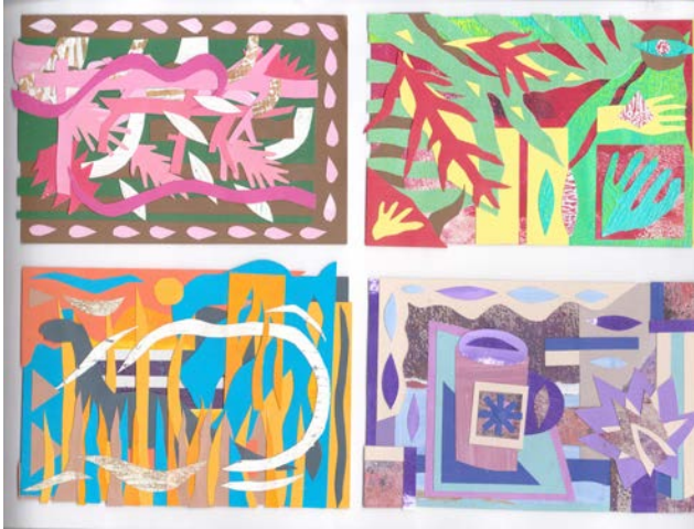
Another example of task 4 (4 collages)