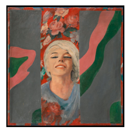
Colour Her Gone, Pauline Boty, 1962. Oil on canvas, 121.9 x 121.9 cm. Description/meaning:

Stringed Figure (Curlew), Version 2, Barbara Hepworth, 1956. Brass, string, wood, 63 x 85cm. Description/meaning: