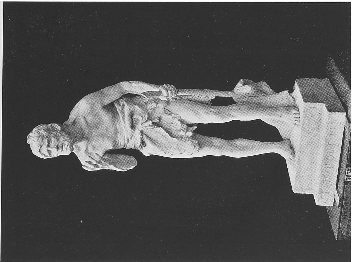
"THE PEASANT OF THE DANUBE" BY VIDAL